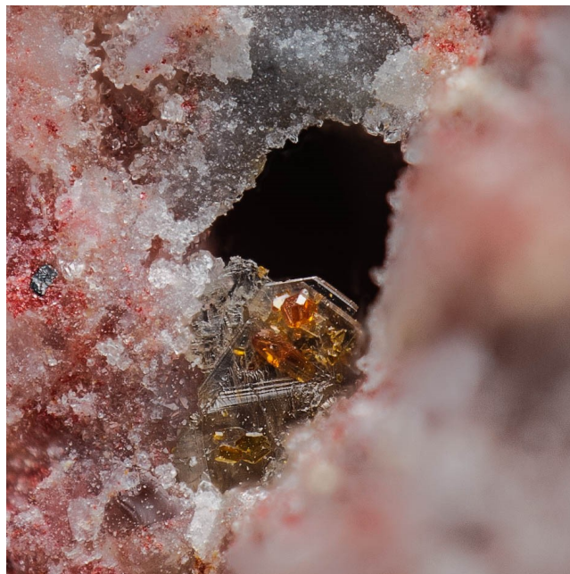
From the NCMA Free Tables: Terlinguacreekite from McDermitt Mine, Opalite Dist., Humboldt Co., NV. FOV: 0.79 mm