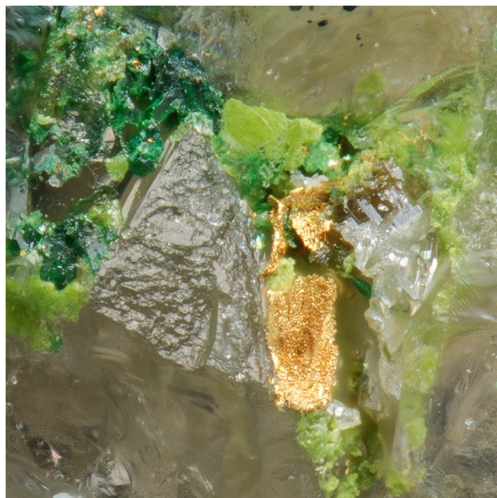
Gold, Khinite and Timroseite from Bird Nest drift, Otto Mtn., Baker, San Bernardino Co., CA. FOV: 0.40 mm