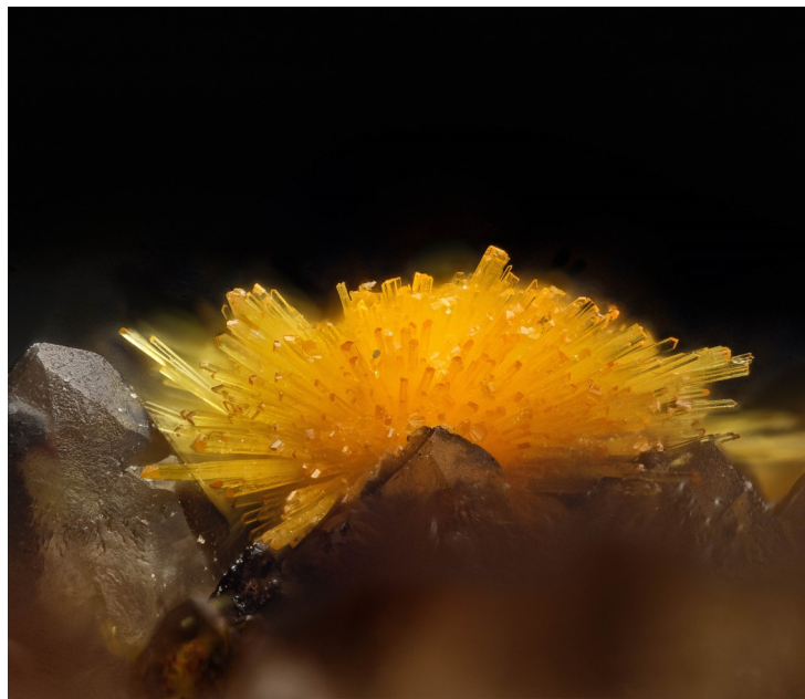
From the NCMA Free Tables: Boltwoodite from Goanikontes Claim, Goanikontes, Swakopmund Dist., Erongo Region, Namibia. FOV: 2.76 mm