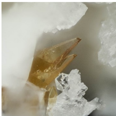
Titanite from MP166