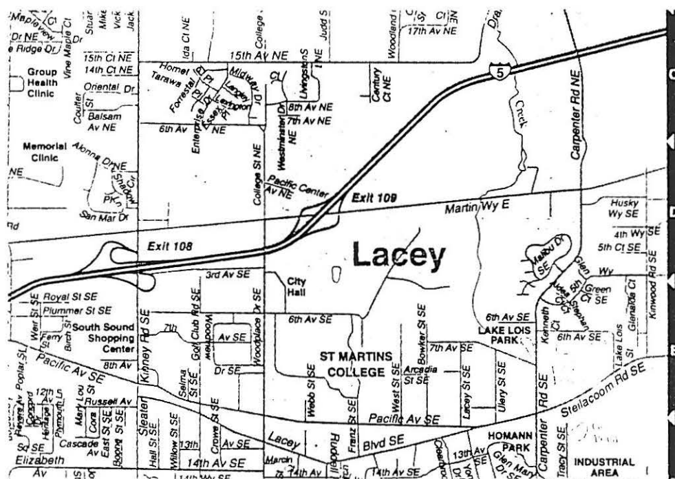
Lacey-Tumwater Street Map