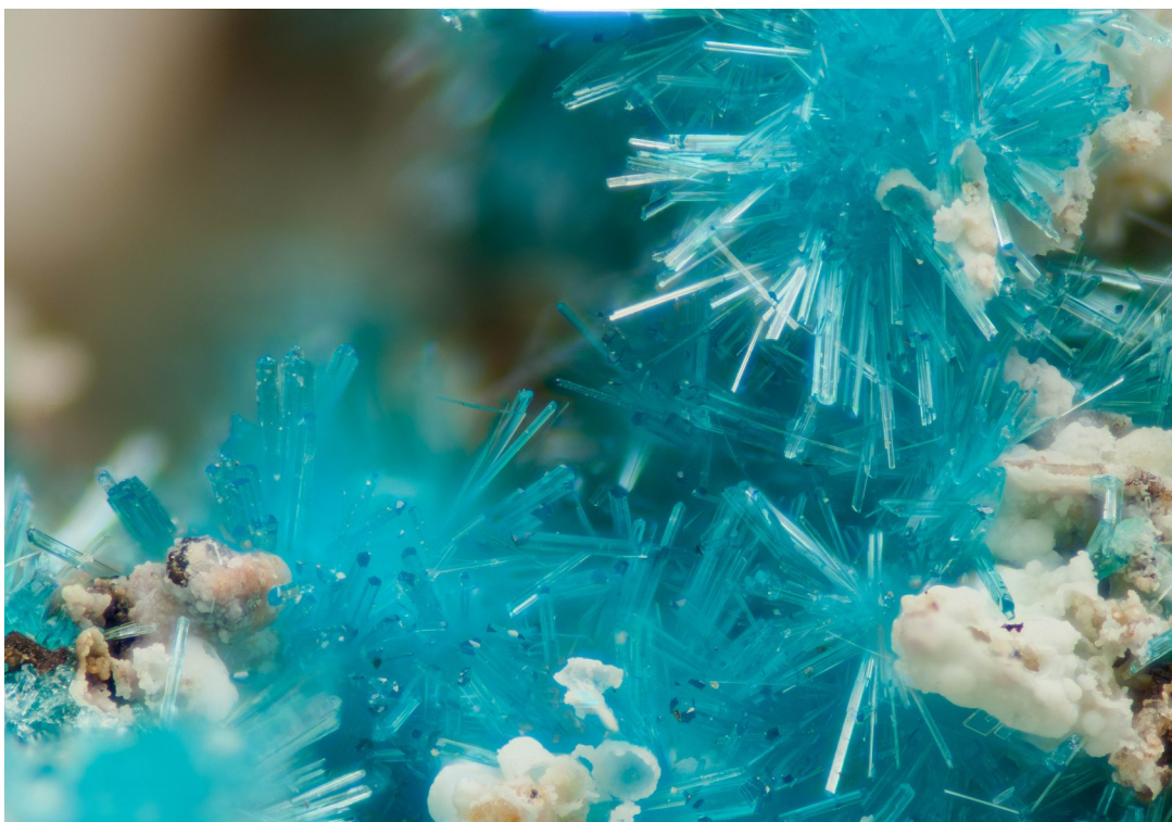
Serpierite from Mi Fiel Rosita Mine, Huasco Prov., Atacama Region, Chile. FOV: 1.59 mm