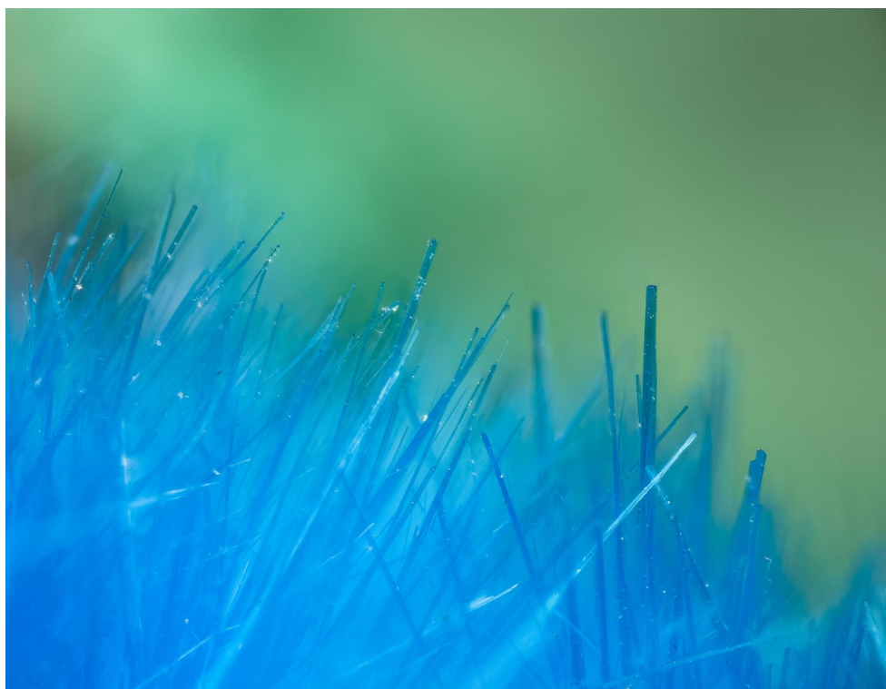
Cyanotrichite from Maid of Sunshine Mine, Cochise Co., AZ. FOV: 2.2 mm