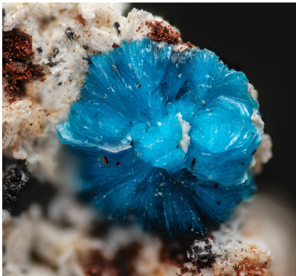
Sampleite from Engaño Fe- liz Mine, Copiapó Prov., Atacama Region, Chile. FOV: 2.54 mm